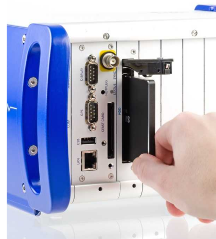
CRC/HDD-FRAME how to insert the SSD